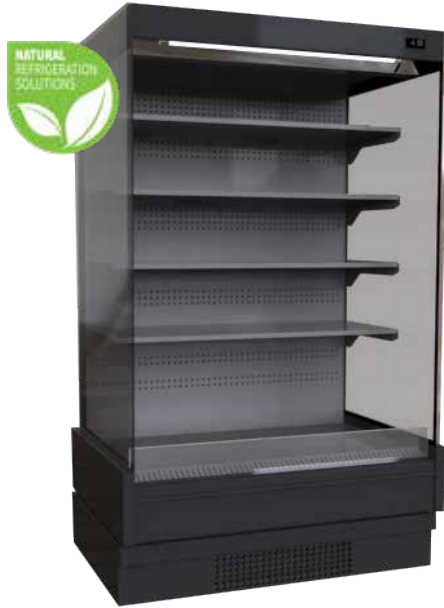
SELF CONTAINED UPRIGHT CHILLER CABINET H1T-10/14/19/26*

EXTERNAL DIMENSIONS: W1040/1350/1980/2600 x D860 x H2090mm