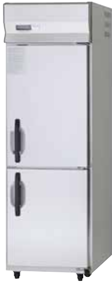
SINGLE SPLIT DOOR SRR-681HP(AUS)

EXTERNAL DIMENSIONS: W620 x D800 x H1995mm*