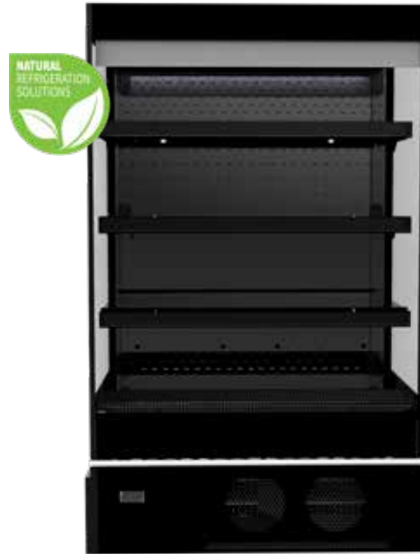
MULTI-DECK SELF CONTAINED CHILLER CABINET H1A*

EXTERNAL DIMENSIONS: W1040/1350/1980/2600 x D860 x H2090mm