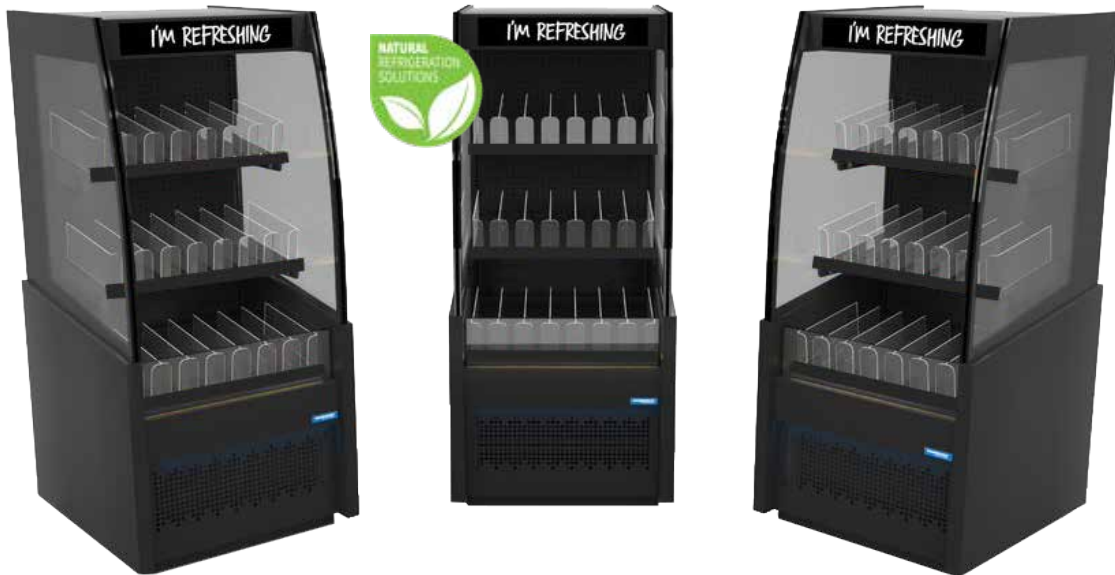
BEVERAGE UNIT SGN141s*

EXTERNAL DIMENSIONS: W1243 x D895 x H2065mm WEIGHT: 193kg