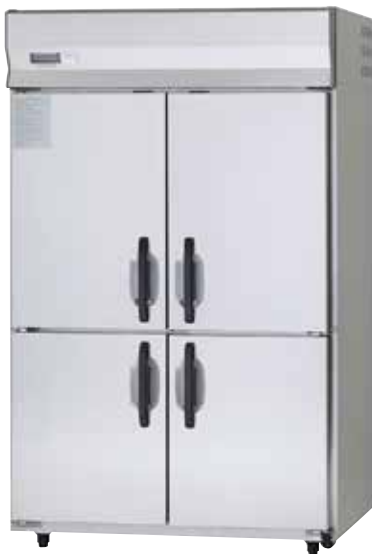
2 DOOR SPLIT DOOR SRF-1581HP(AUS)

EXTERNAL DIMENSIONS: W1460 x D800 x H1995mm*