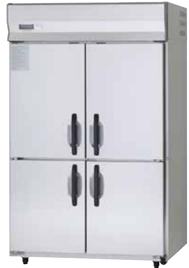
2 DOOR SPLIT DOOR SRF-1281HP(AUS)

EXTERNAL DIMENSIONS: W1210 x D800 x H1995mm*