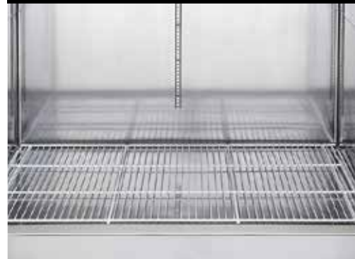
Round corners for easy cleaning