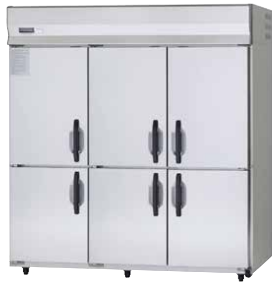
3 DOOR SPLIT DOOR SRF-1881HP(AUS)

EXTERNAL DIMENSIONS: W1800 x D800 x H1995mm*