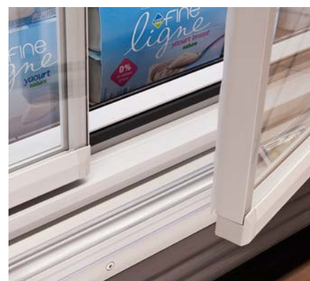
SCHOTT Termofrost® AGD 3