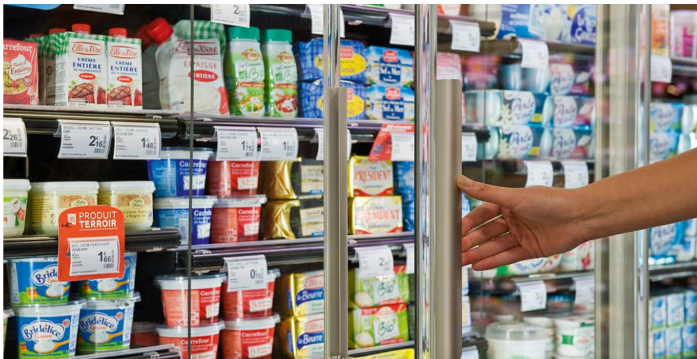
Perfect view for easy orientation at a multideck cabinet: SCHOTT Termofrost® T.AGD 3

SCHOTT Termofrost® AGD 3: All glass door system for plus cooling