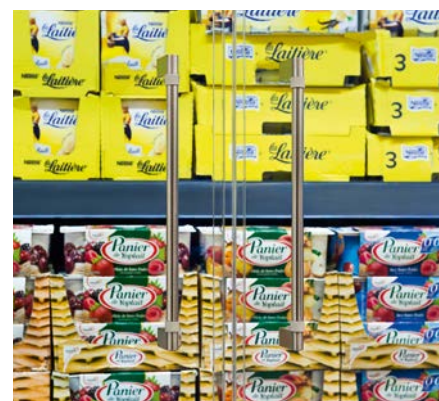
Slim handles emphasise the crystal clear look