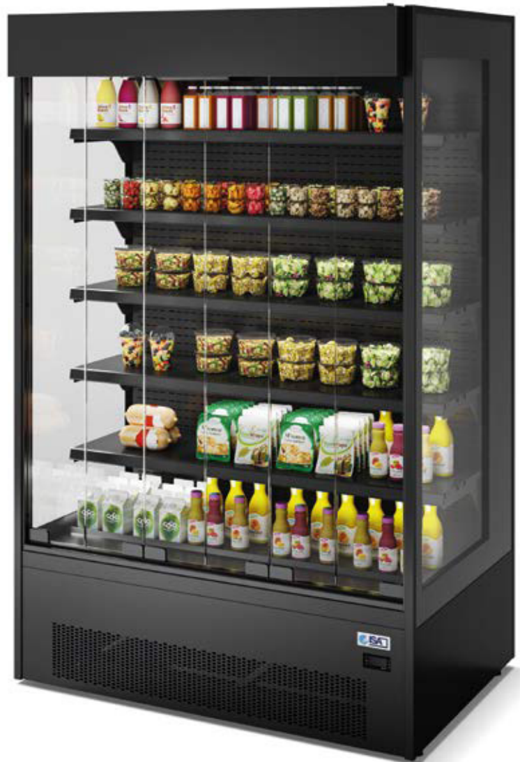
Multideck Display with Smartflex Automatic Opening Doors