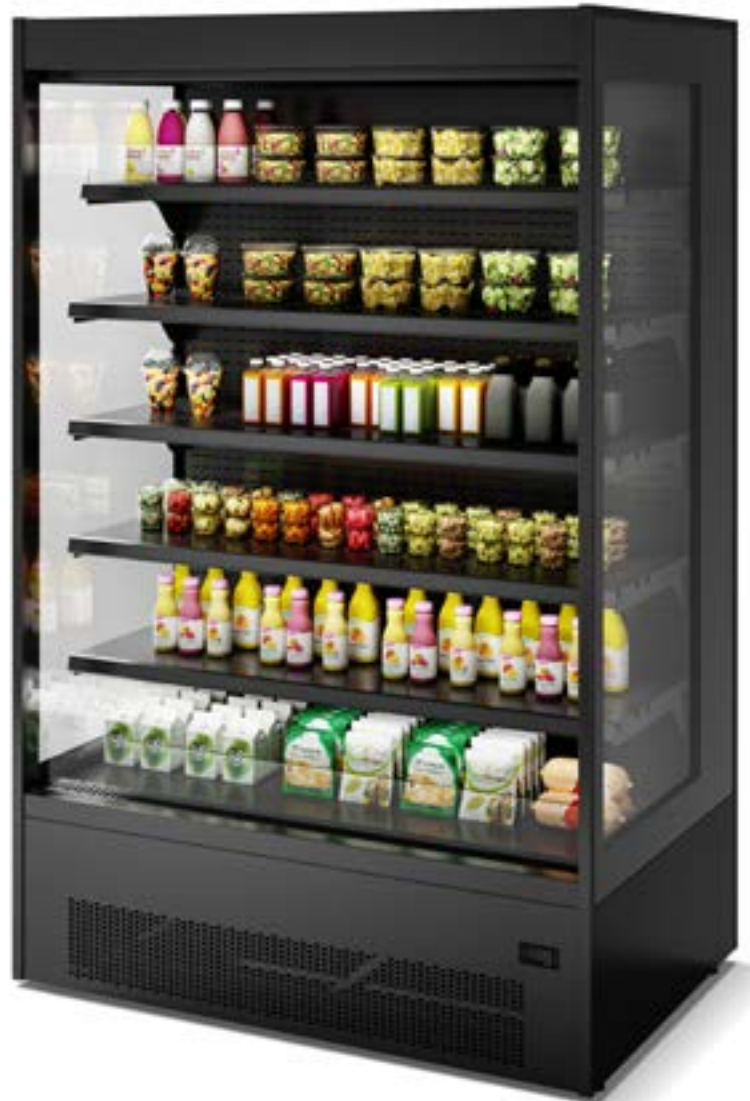
Multideck Display with Open Front