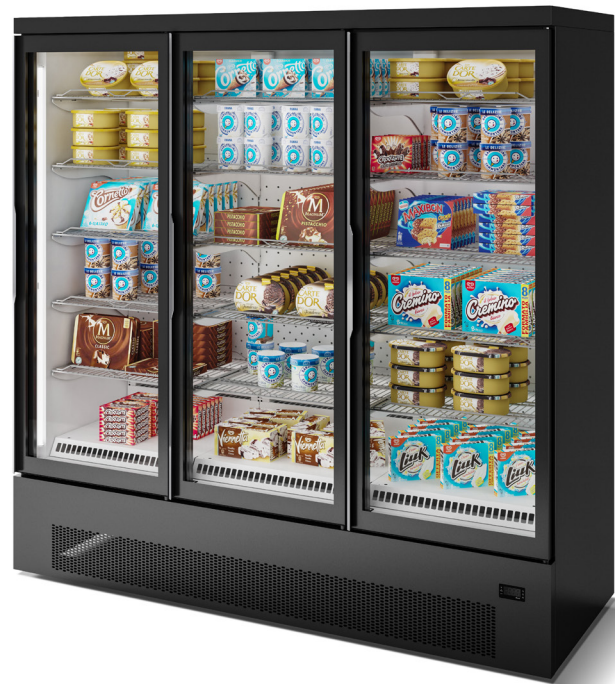
Glass Door Freezers