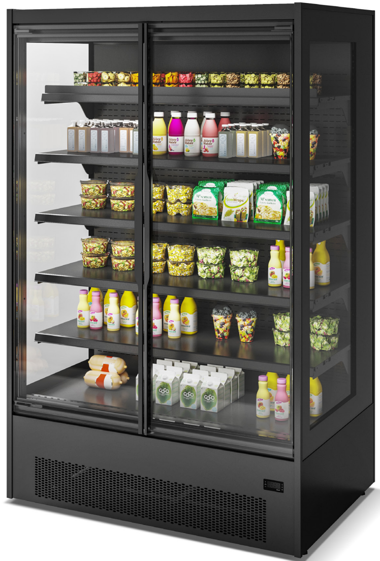
Multideck Display with Double Glass Doors