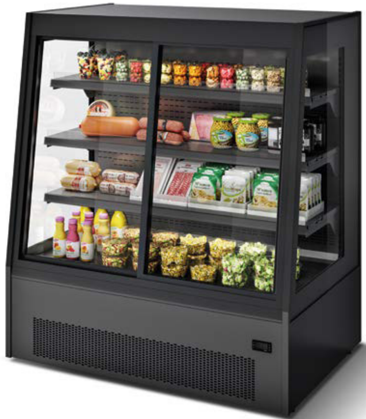
Sliding Glass Door Low Height Merchandiser